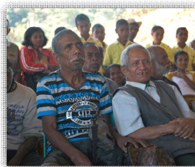
Peace Activity "How to Prevent Conflict in the Community" Fahinehan village, Manufahi.

This document has been produced with the support of the European Union through the Instrument of Stability, GIZ/BMZ in cooperation with the Ministry of Youth and Sport and the Government of Ireland's Conflict Resolution Unit. The contents and opinions in this document are the sole responsibility of Belun and CICR and can under no circumstances be regarded as reflecting the position of the European Union, the Irish Government or GIZ/BMZ. This situation review reports on key issues related to violent incidents and trends emerging from data collected through Timor-Leste's Early Warning, Early Response (EWER) system during September 2012. Belun endeavors to share information that is both up-to-date and accurate. Given situations evolve rapidly, we welcome further information which may clarify or update data acquired through EWER. Please email EWER Program Manager Bylah Da Costa: bylah.belun@gmail.com .