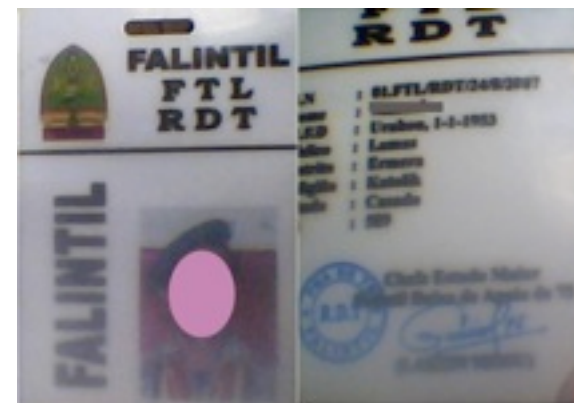
Identity Card of a FALINTIL- FTL-RDT Group Member

Belun's monitoring has revealed that, in the subdistrict of Hatolia (Ermera), a group has been running a scam to recruit people to become members of a group with the name: " FALINTIL, FTL RDT (Timor-Leste Defense Force, Democratic Republic of Timor) " which they claim will replace the current F-FDTL. Part of the scam is requiring US $13 from members to gain an identity card (as pictured). Claims of the existence of an additional military group would violate Article 146 of the RDTL constitution which presents F-FDTL as the only defence force of Timor-Leste.