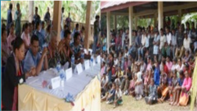
CPRN Seminar in Lautem Sub-district