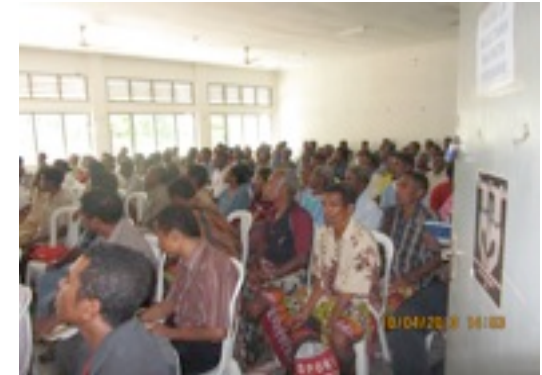
CPRN Seminar for Oecusse District – "Strengthening Peace and Stability on the Border"