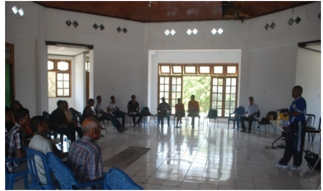
Participants at Belun's LDMR Mediation Training in sub-district of Manatuto

In Aileu, community members from the aldeia of Sarin killed a buffalo owned by person from the aldeia of Riafusu after it destroyed their crops. In response, the community of Riafusu destroyed a water well in Sarin.