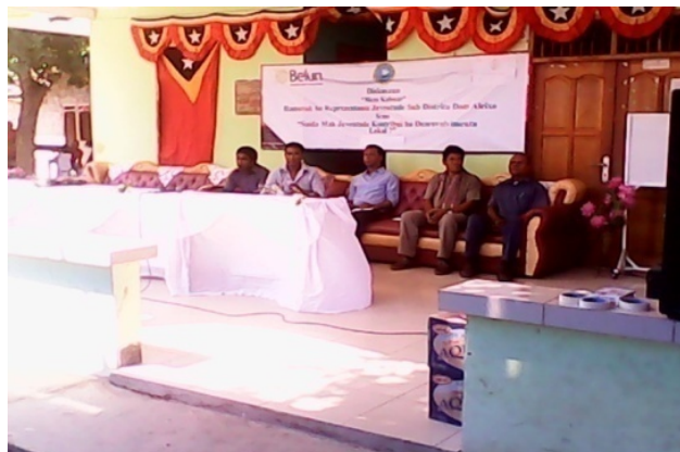
Round Table Discussion, Dili. Attended by the Secretary of State for Professional Training and Employment (SEFOPE), President of The National Youth Council of Timor-Leste (CNJTL) and the 12 November Commission.

District level: From October 20 – 27 2013, the EWER program conducted Round Table Discussions discussing “How youth can contribute to local development” in (5) districts: Ermera, Aileu, Baucau, Liquica and Dili.